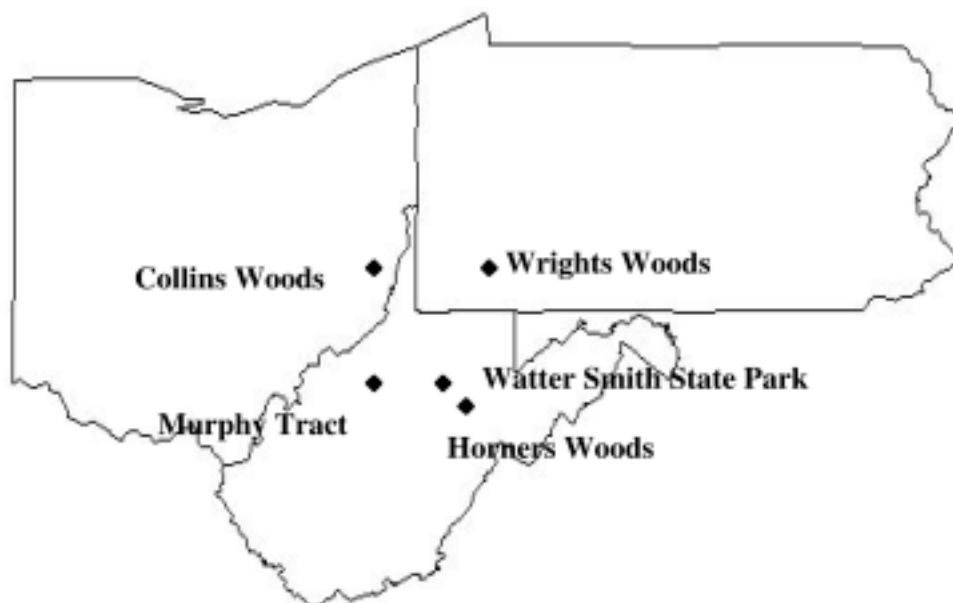
Figure 1. Location map of oak-dominated, old-growth study stands.

Fifteen potential study sites in eastern Kentucky, western Pennsylvania, eastern Ohio, and central West Virginia were evaluated for more intensive study using four criteria: (1) the presence of large (dbh \geq 75 cm), old ( > 200 yr) oak trees; (2) the absence of evidence of widespread human disturbance (e.g., logging, grazing); (3) a minimum size of \sim 4 ha (i.e., large enough to maintain a buffer of at least 50 m from plot borders to the edge of the stand); and (4) a stand composition that is dominated by deciduous trees with dominant or codominant (Smith et al. 1996) oaks as a major component of the overstory. Five stands were selected: Collins Woods in Belmont County, Ohio; Wrights Woods in Washington County, Pennsylvania; and Watter Smith State Park, Murphy Tract, Horners Woods, in Harrison County, Ritchie County, and Lewis County, West Virginia, respectively (Figure 1). Size of the old-growth stands ranged from 5–22 ha; three of